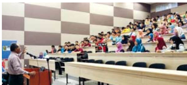
Route to be MIEM/PEng Talk