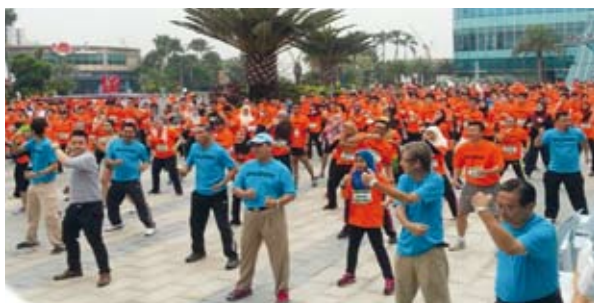
Warming Up Aerobics

The day ended with the group ALS ice bucket challenge. 100 brave participants took part in the challenge together with the Organizing Committee and Executive Committee of IEM (Southern Branch). The JB Engineer's Run was a joyous and memorable event but it would not have been possible without meticulous planning, concerted effort of the organizing committee, support from the Past Chairmen and most of all the commitment and hard work of the volunteers amongst the Young Engineers and Student Members from Universiti Teknologi Malaysia and Universiti Tun Hussein Onn Malaysia as well as participation of students from Politeknik Ibrahim Sultan.