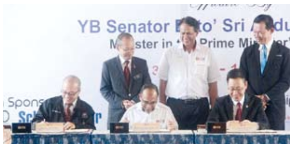
MoU IEM – UTM