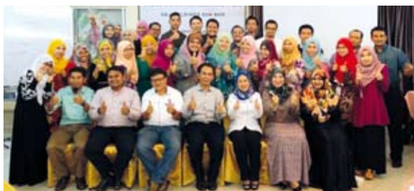
Professional Talk – SAJ Holdings