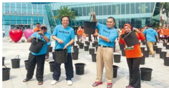
Group ALS Ice Bucket Challenge