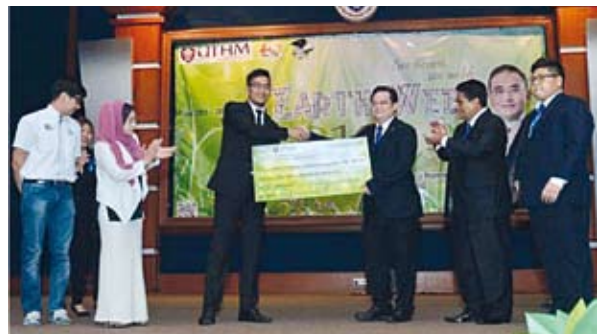
Mock Cheque Presentation to Perbadanan Taman Johor