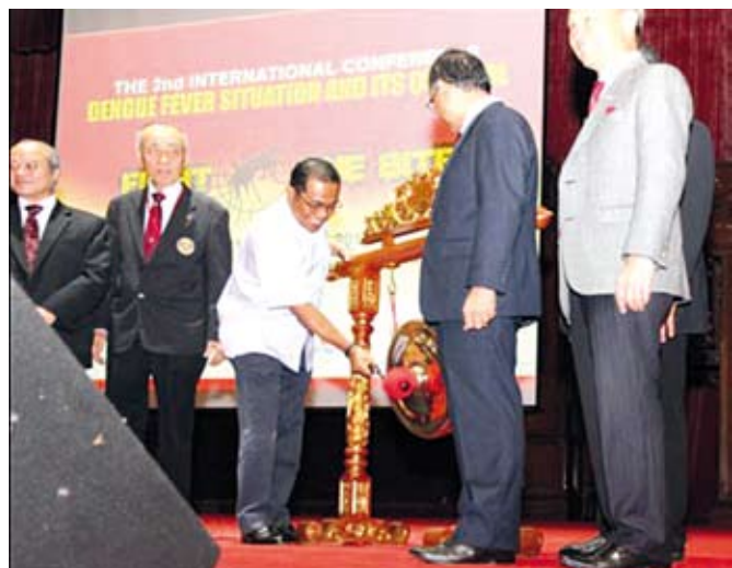
Y.A.B. Dato' Seri Mohamed Khaled bin Nordin, Menteri Besar Johor declaring open the 2 nd International Conference on Dengue Situation and Its Control at Universiti Teknologi Malaysia, Johor Bahru.