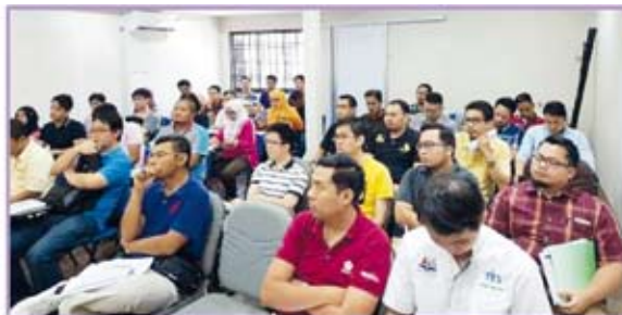
Enhanced Professional Interview Scheme