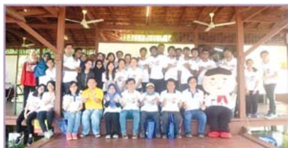
VIPs & Infinity Charity Run Organising Committees