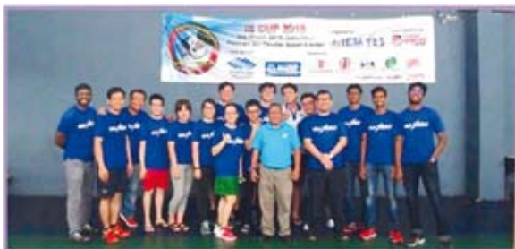
IE Cup 2018