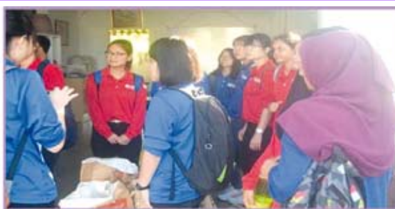
Charity visit to Berkati Children's Home