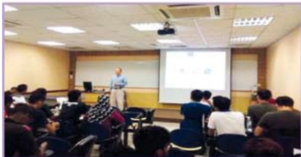
Safety & Health Training Course at C17, UTM