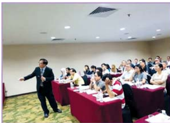
Short Course on Slope Engineering