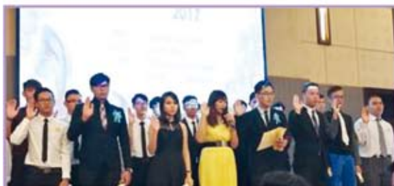
IEM UTHMSS Committee swearing in during AGD