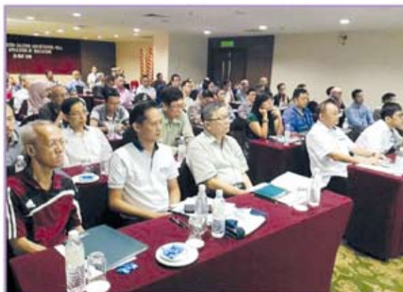
Slope Stabilisation Solution and Retaining Wall System Application