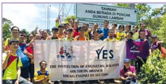
916 IEM Gunung Lambak Expedition