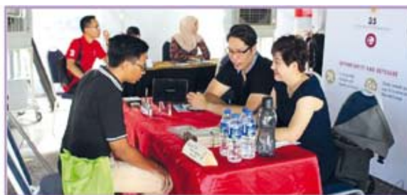
Career Booths at Career & Innovation Fair