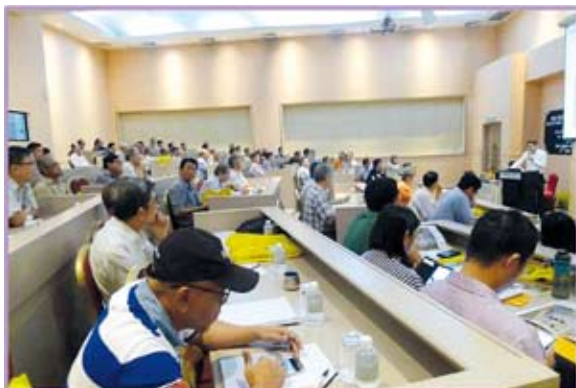
Introduction to SIKA’s Waterproofing System