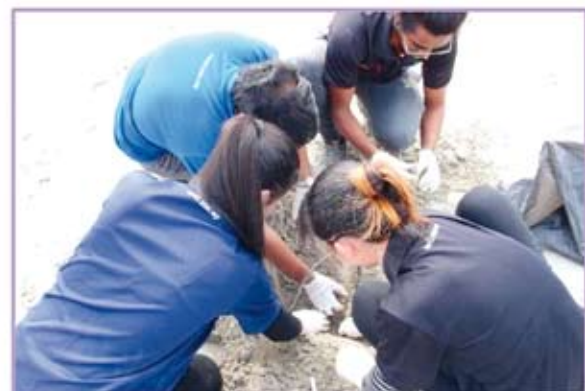
Community Cleaning Services at Tanjung Balau Beach