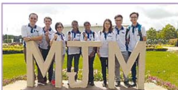
National Summit 2017