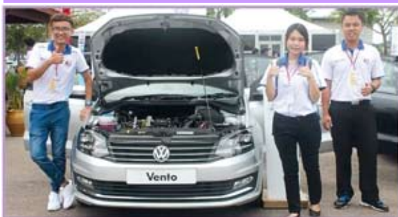
Committees of Autoshow Competition