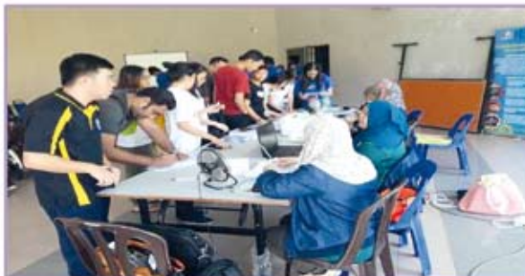
Members Recruitment Drive 2017 at UTM