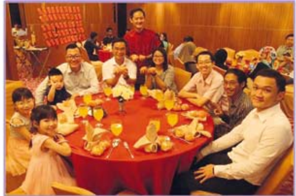
Lunar New Year Open House at Hotel Granada