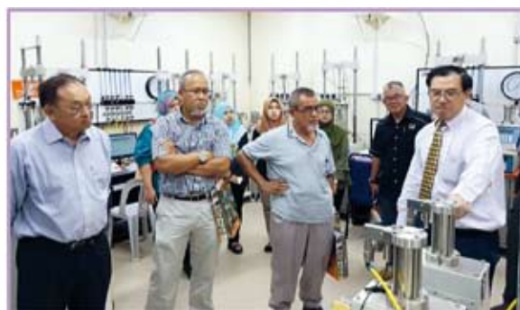
Geotechnical Laboratory of Geolab (M) Sdn Bhd