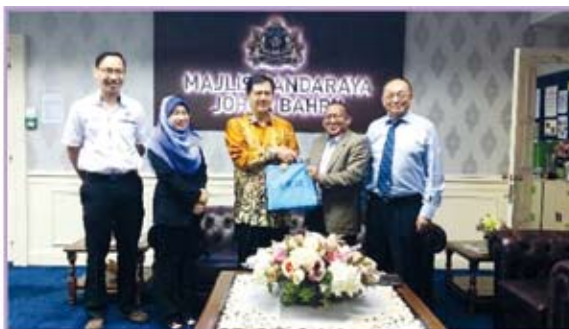
Courtesy Visit to MBJB