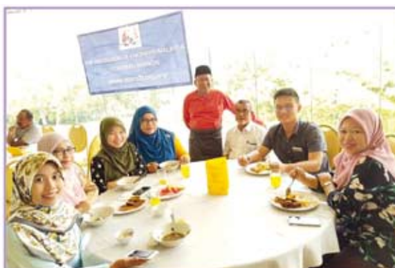
Hari Raya Celebration with IEM members