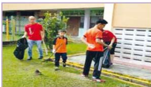
IEMSB "Gotong Royong – Search & Destroy"