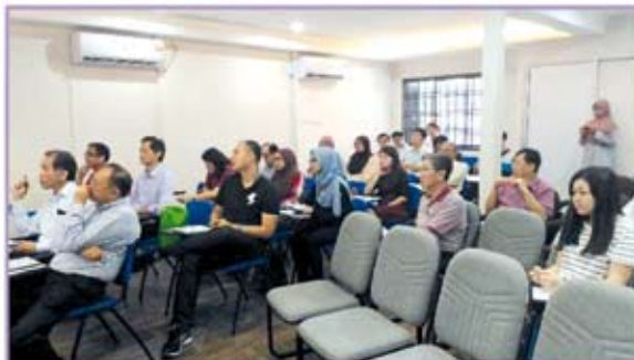
Design of Steel Structure Using Eurocode 3