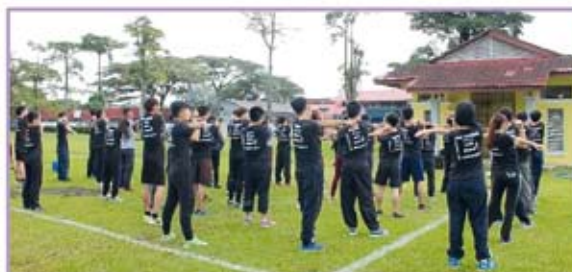
Warm up session for Obstacles Run