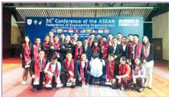
CAFEO Bangkok 2017