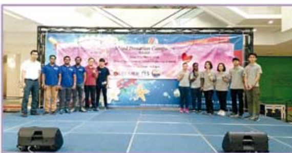
Blood Donation Campaign at Tasek Central