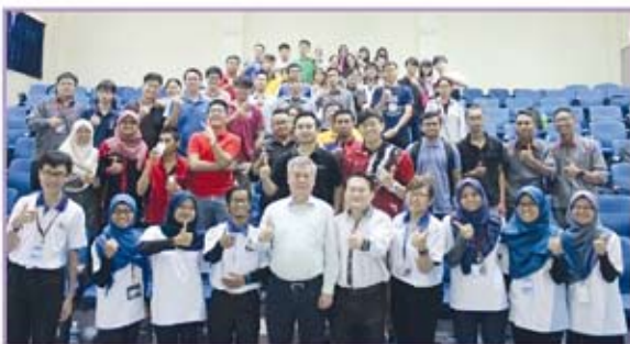
VIP & participants for Professional Engineer Talk