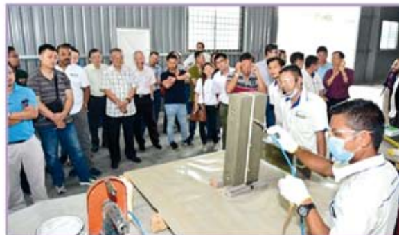
Cemseal Industries Sdn Bhd