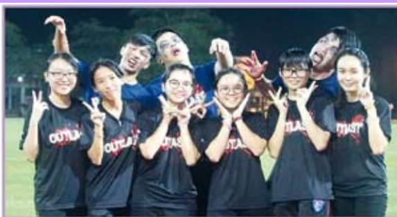
Participants and Zombies for Outlast UTHM