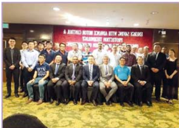
Energy Saving with Advance Motor Control & Protection Technology