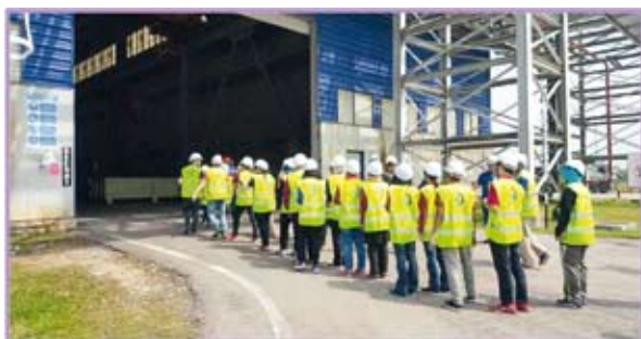
Factory Visit to Bahru Stainless Steel Sdn Bhd