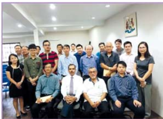
MSIEC 62305 Series