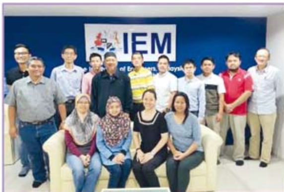
Introduction to MyCESMM