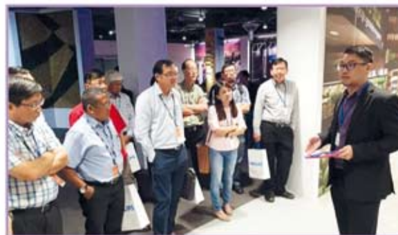
Geotechnical Laboratory of Geolab (M) Sdn Bhd