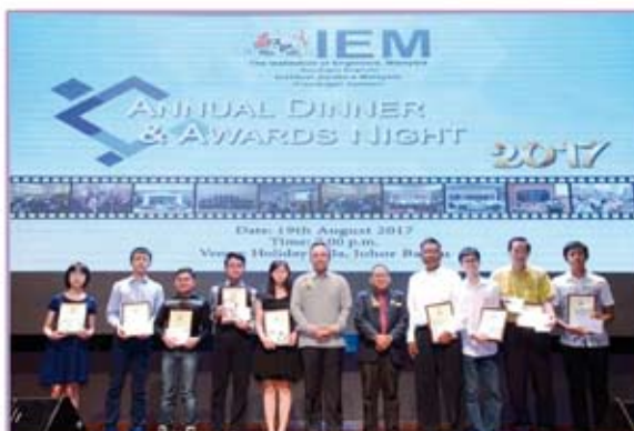
Annual Dinner and Awards Night 2017