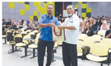
Talk on Route To MIEM/Peng at UTM