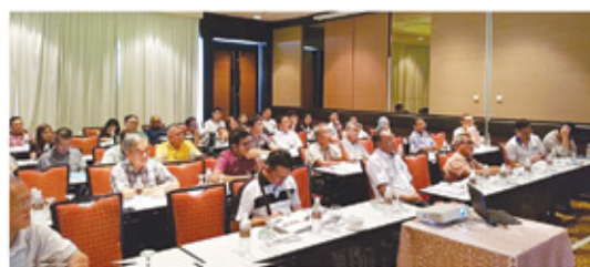
Introduction to Mechanical Splices" and "Precast Lifting and Connections