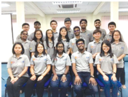
Committee of UTM Student Section 2017/2018