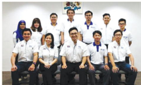
Annual General meeting of Young Engineer Section