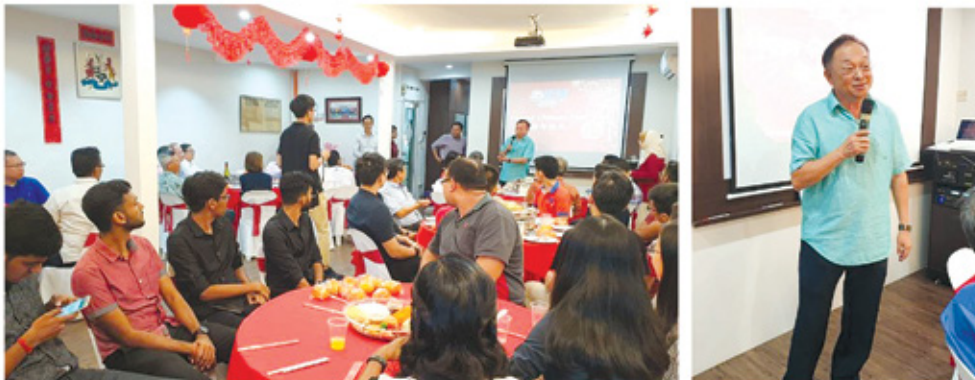
Lunar New Year Open House 2019