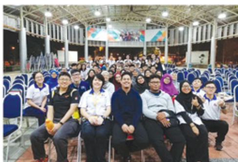
IEMSS UTHM Welcoming Night