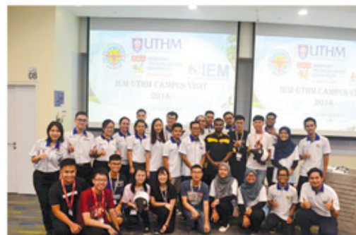
Green Youth Warrior