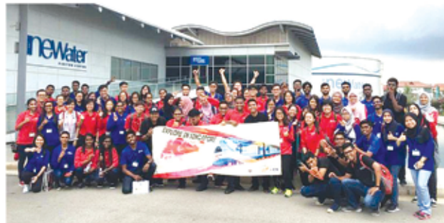
Explore in Singapore