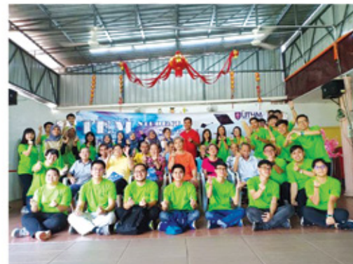
Visit old Folks Home