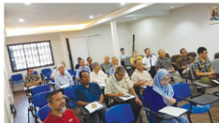
Refresher Workshop for IEM (Southern Branch) PI Interviewers