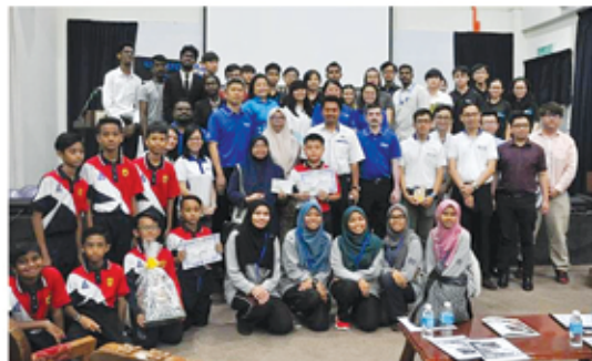
Engineering Festival 2018