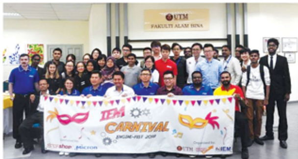
Engineering Festival (Coffee with IEM) 2018