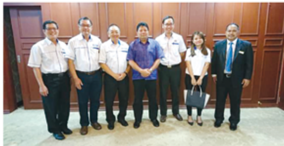
Courtesy visit to the Office of YB Mazlan bin Bujang, EXCO of Public Works, Infrastructure and Transportation Johor