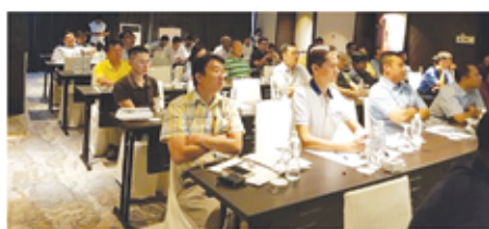
Adoption of IBS Mechanism in Malaysia