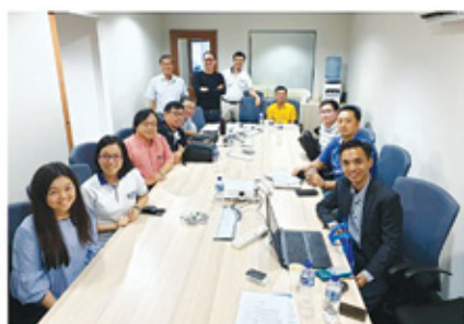
Introduction to EPA Stormwater Management Model (SWMM)