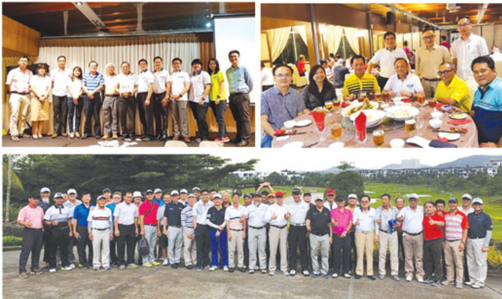
Inter-Professional Golf Tournament 2018