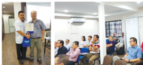
Post-Installed Rebar Design