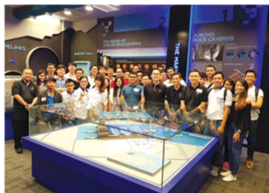
Technical Visit to Jurong Rock Cavern