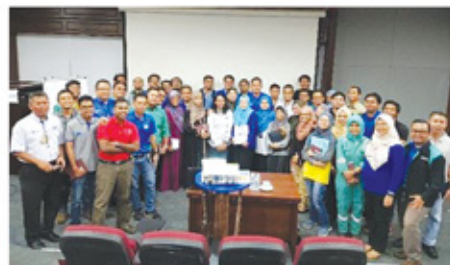
Talk on Route To MIEM/Peng at MMHE