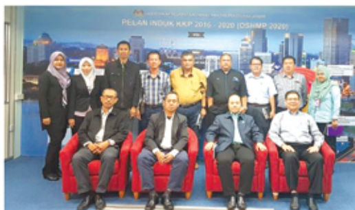
Occupational Safety and Health in Construction Industry Management (OSHIM)