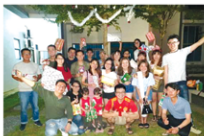
Christmas Bonding and Gift Exchange