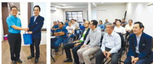
ASEANising Electrical Engineers