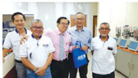
Technical Visit To Geotechnical Laboratory of Geolab (M) Sdn Bhd