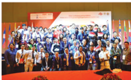
CAFEO Singapore 2018