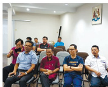
Steam Boilers System Act and Regulations, Safety and Inspection