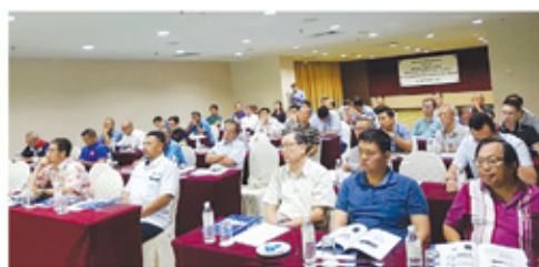
Moving Forward with Molecular Oriented (PVC-O) Pipes