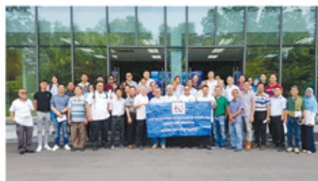
Technical Visit to Industrialized Building System (IBS) Factory