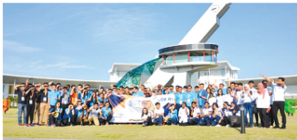
National Summit 2018