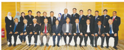
45 th Annual General Meeting (AGM)