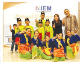
IEM (Southern Branch) Annual Dinner and Awards Night 2018